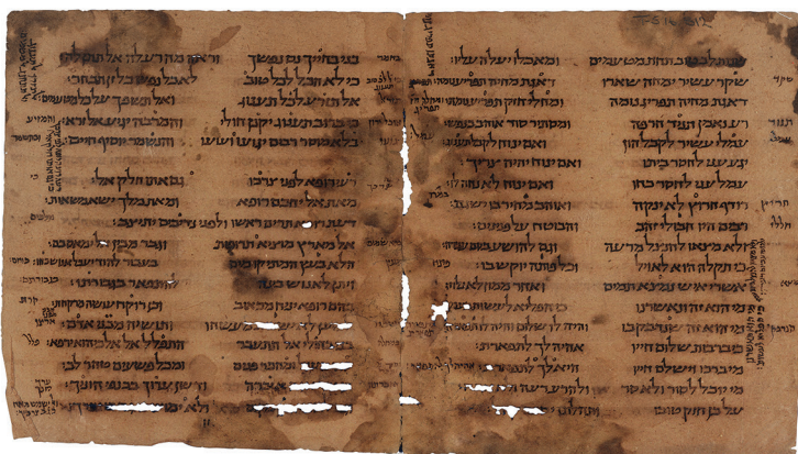
Cambridge University Library T-S 12.864 with the permission of the Syndics of Cambridge University Library

Fragments of the original Hebrew text of Sirach have been found among the Dead Sea Scrolls and in the Cairo Geniza, the source of the fragment shown here. Sirach did not become part of the Hebrew Bible, but was included in the Septuagint and Vulgate.